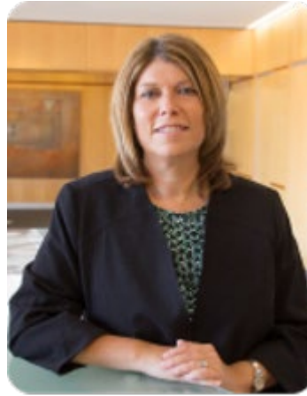
Michelle Leta Foundation Operations Coordinator